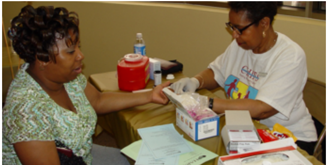
Blood glucose testing at a community free clinic

Free health clinics have been in existence in the United States since the 1970s. The purpose of them was to manage and treat patients in the local community who otherwise would not be able to pay for medications and other therapies. These clinics were in response to both to changes in the economy and the health care system. CHIPS (Community Health in Partnership) is one of the free clinics that blossomed out of the need for increased access to medical care to low income people. It was established in the 1990s and located in downtown St. Louis, MO. Due to the patient population being treated in this clinic, the resources are based on donations from local hospitals and laboratory and radiology services in town. There has not been much study on the effects of