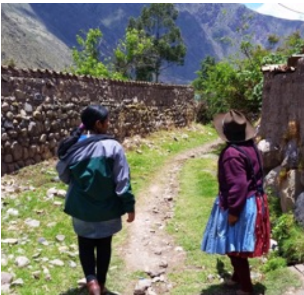
Peruvian citizens taking in the beauty of the Andes mountains.

My experience here is best described in pictures. I participated in campaigns located in the outer villages of the Andes mountains, where women were educated about their anatomy, the importance of surveillance (Pap smears and breast examinations) and HPV prevalence. I processed endocervical curettings, cervical biopsies and LEEP specimens without conventional machinery, and participated in a tele-pathology conference which enabled the diagnostic expertise of pathologists in the United States to help the women in Peru fight cervical cancer. I was able to help a community health clinic improve its laboratory processes, help with the quality control and validation studies of pathology-related services, and provide a helping hand in expediting the outreach programs. Overall, it was a rewarding experience.