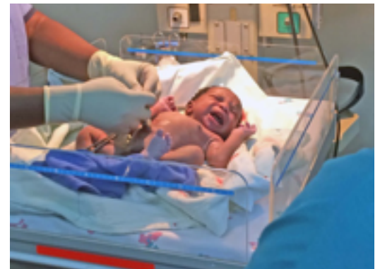
Newborn exam to access the health of this great addition to our world

Expectant mothers who go into labor usually arrive at the hospital with their families in tow for assistance. After birth, they spend one to three days in post-partum Maternity care before going home. If a woman had a C-Section, she will spend one week in post-partum care. All new mothers receive a follow-up visit one week after their release.