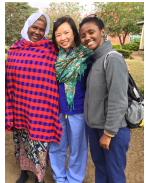
Making friends and sharing knowledge to provide the very best medical care

Despite these limitations, I was amazed at how calm and collected the physicians remained. In addition, I was constantly amazed at the breadth of knowledge each physician had, not only in his or her own fields, but also in primary care. Seeing how medicine is practiced abroad has made me appreciate the basic skills of the physical exam and pattern recognition diagnosis. Often, during our clinical rotations in the states, we begin to rely on ordering unnecessary labs and imaging to confirm a diagnosis that could have been reached through a simple history & physical examination. Sometimes, we might rotate through services that are not exactly the most interesting. But in the world of global health, it all matters! Every minute skill is important and you never know how that piece of information will benefit your patients abroad.