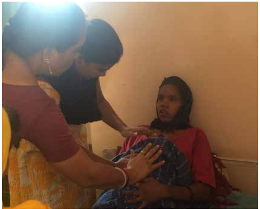
Providing a frightened mother with care and encouragement.

In addition, I helped develop a take-home kit for newborn care to send home with mothers of high-risk newborns.