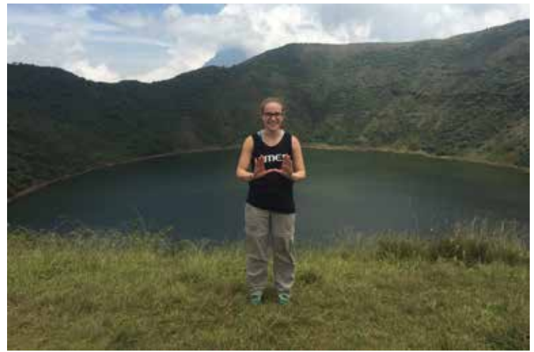
Feeling humble and totally “zen”

The lack of resources, both medical as well as human resources, was often disheartening. It was frustrating to see how many adverse